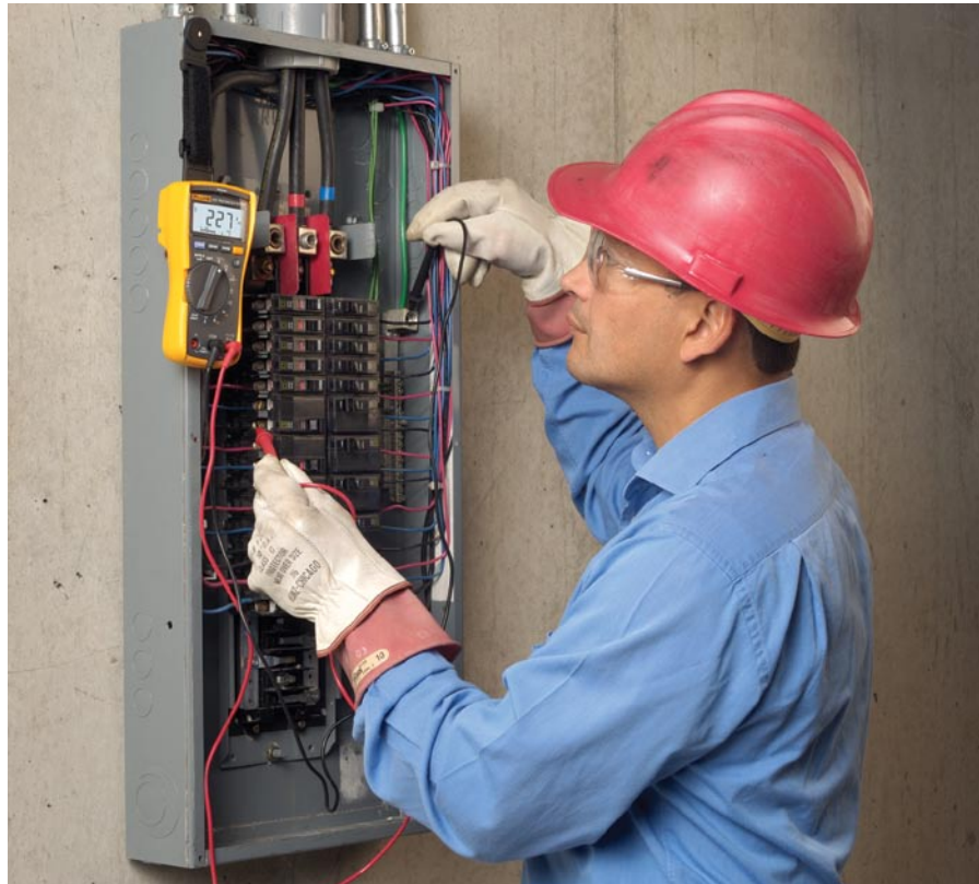
For standard electrical measurements, high impedance meters are preferred, unless ghost voltage is present.

LoZ stands for Low Impedance (Z). This feature presents a low impedance input to the circuit under test. This reduces the possibility of false readings due to ghost voltages and improves accuracy when testing to determine absence or presence of voltage. Use the Auto-V/LoZ switch position on the DMM when readings are suspect (ghost voltages may be present) or when testing for the presence of voltage.