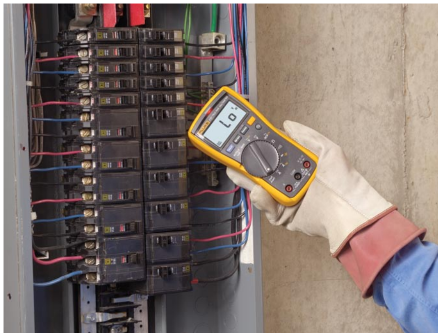
Using the non-contact voltage detector function before making a contact measurement adds an extra layer of safety.

This feature allows technicians to quickly determine whether a panel, cabinet, or machine is properly grounded. If ac voltage is detected, the troubleshooter should then use the Auto-V/LoZ function to determine if the detected voltage is ghost or hard before beginning work.